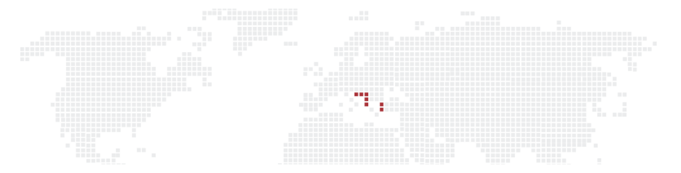
Governance and Home Affairs

ALBANIA - Preparation of guidelines for the applicants to "Support to the civil society organisations in the implementation of capacity building actions addressed to increase the politic dialogue and the awareness concerning the European Integration Process" in the IPA 2014 Program "European Union Integration Facility"